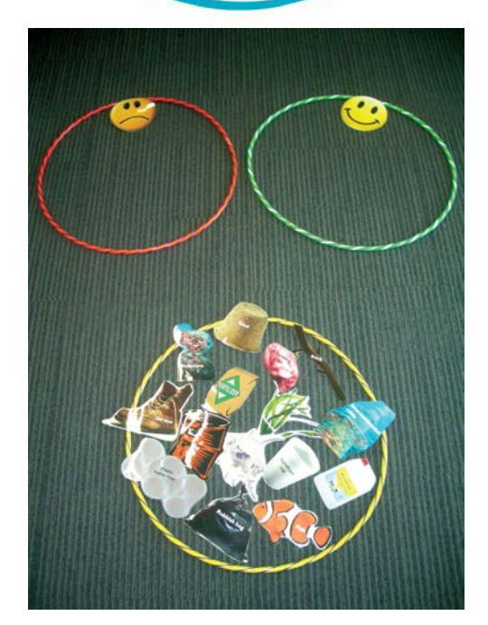
Figure 1 'The nest' hula hoop